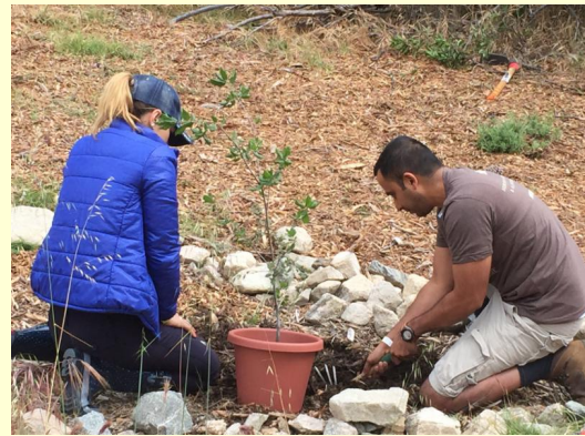
LA works volunteers plant trees at Rosemont

120 volunteers celebrated Earth Day in style with a community service day at the Rosemont Preserve in April. Funded by corporate sponsor PharmaVite, volunteers built a new side trail, assembled a storage shed, spread mulch to help maintain the trail, weeded the outdoor classroom and tended to our one-year old trees on the south slope. All this work helps to restore the habitat at Rosemont and maintain our outdoor classroom and trail for our outdoor education programs.