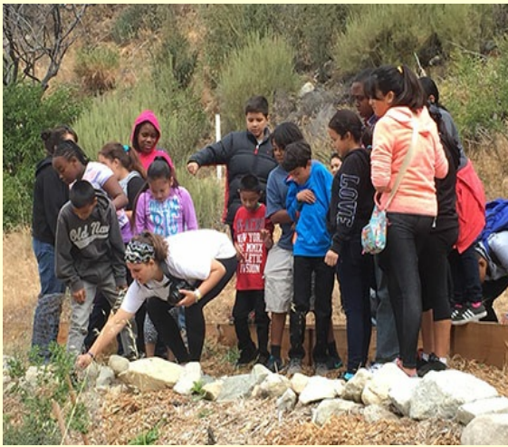
99th Street Elementary volunteers

Volunteer groups included PharmaVite, Corgan Architect & Design Firm, 99th Street Elementary School, CSU Los Angeles' Volunteer Management Class and CSU San Bernadino students. Everyone had a great time and much was accomplished! Thanks to the Friends of Rosemont for staffing the event, PharmaVite for their sponsorship and LA Works for all their hard work and great organization!