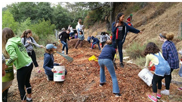
7th Grade Westridge students move mulch at Millard

On May 22nd, 7th graders from Westridge School visited 2 AFC properties to study soil and volunteer to help restore the native habitat. At Millard Canyon the students helped move a huge pile of mulch to help protect newly planted trees and reduce the fire hazard to our neighbors.