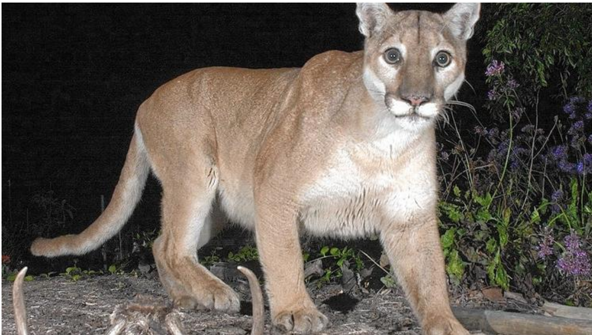
A remote camera captured the mountain lion known as P-41.

Did you see the Los Angeles Times' article about "P-41" - the Puma being tracked through the Verdugo Mountains? Well, it highlights why we are so passionate about preserving Cottonwood Canyon! Here's what we want to happen: P41 moves east into the San Rafael Hills and meets our own Cottonwood "P" who passed through Devil's Gate Dam and Cottonwood Canyon en route to the San Rafael. We want to make it easier for these two to get together...and if they're a match, maybe have a few little "p"s of their own! Preserving Cottonwood Canyon is the key to making this happen!